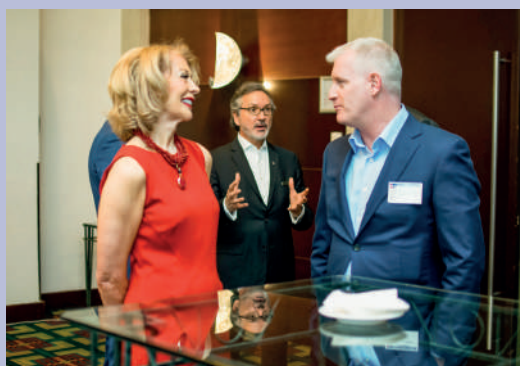
Guests at AmCham Sundowners 2018

27 April, Almaty Arba Wine Bar Sponsor: AmCham