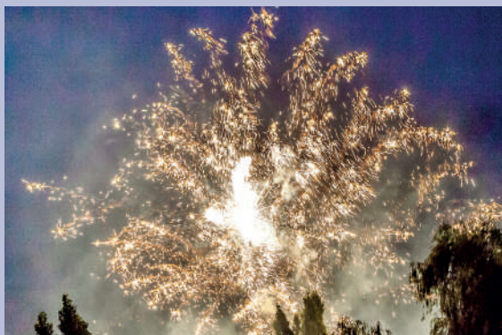
U.S. Independence Day Celebration 2018