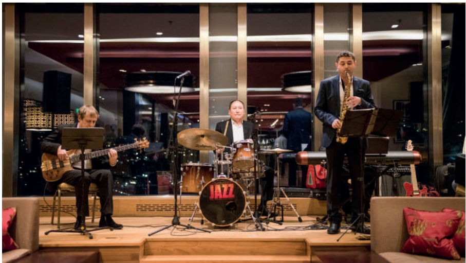
Almaty Sundowner 2018, Jazz Band at the Ritz Carlton Vista Lounge

It is intended to maintain the same intensity of ever-popular social and business networking events in 2019, providing AmCham members in Almaty, Astana, and the Caspian region with every opportunity to gather together at Sundowners, hear outstanding speakers at Business Roundtable Luncheons , attend seminars, workshops, and conferences under the AmCham Economic Policy Forum series, and celebrate the holidays with family and friends.